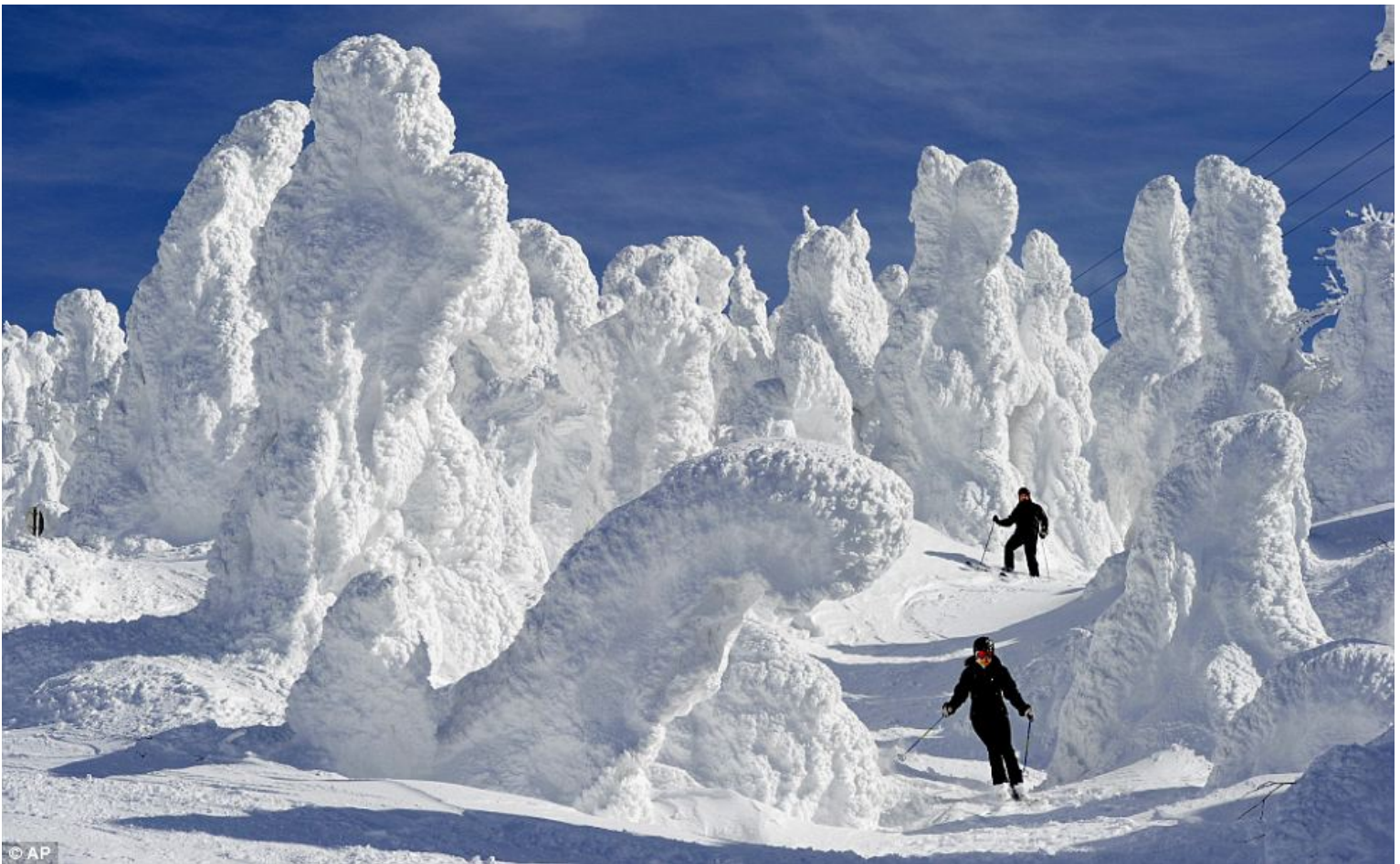
Like bizarre creatures rising up out of the ground, these trees are clad in snow and ice after bitterly cold weather in northern Japan. Savouring the unique scenery skiers make their way downhill in at the Zao Onsen ski resort