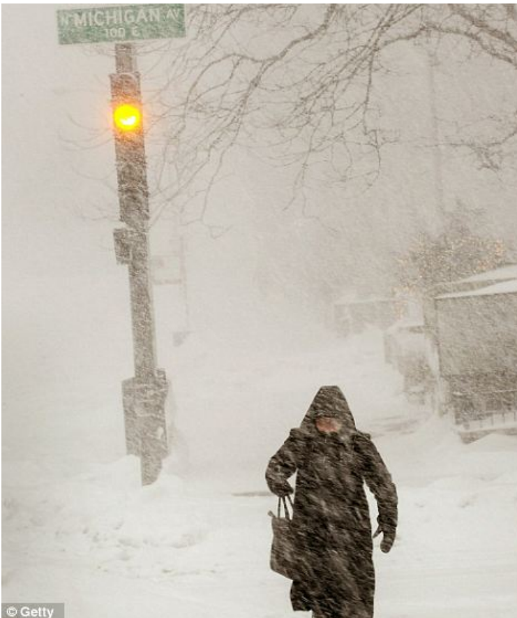
You waiting? I'm walking! While one man waits for a bus in Chicago, another decides to make his way on foot through a snowstorm. A woman, right, wades through a snow drift in the city that comes up to her waist