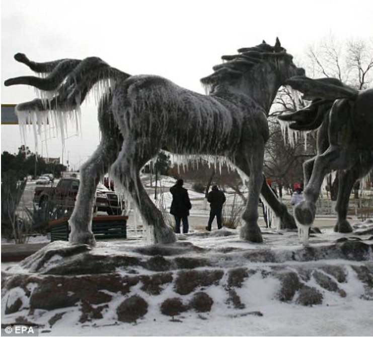
From one end of the U.S. to the other the impact of the blizzard has been felt. Left, a woman makes her way along an icy pavement in New York while, right, ice covers a statue in Ciudad Juarez, northern Mexico