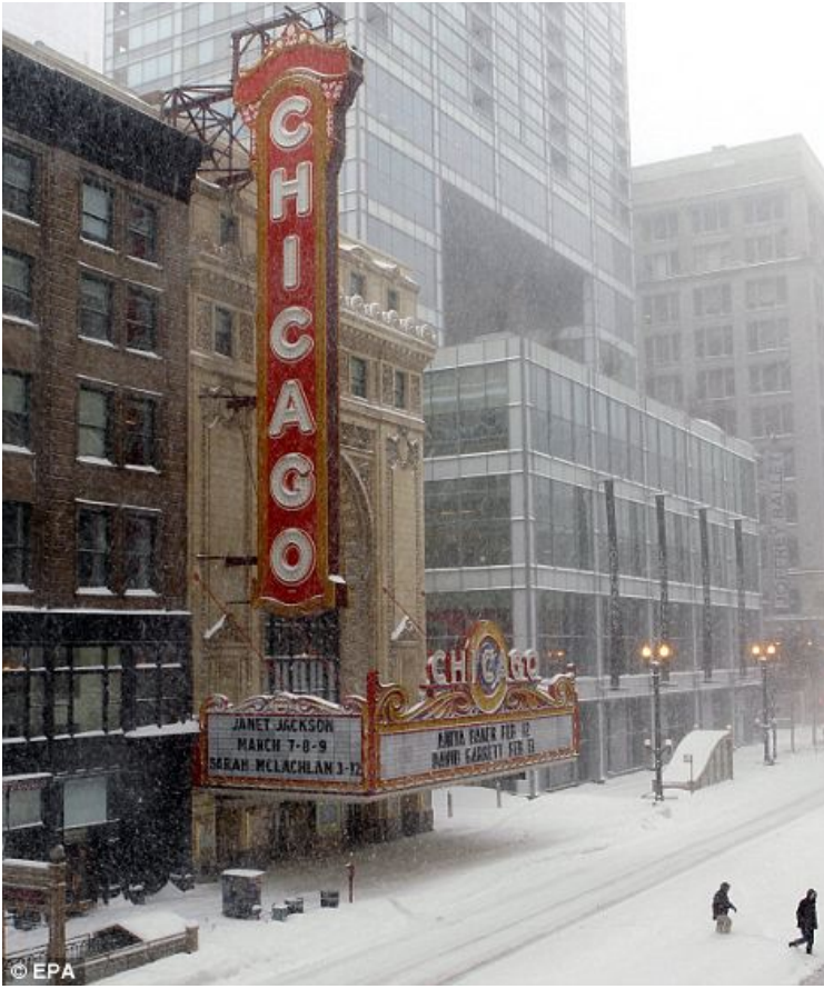
By foot is the sure way to get to where you want to as this woman (left) and these men found