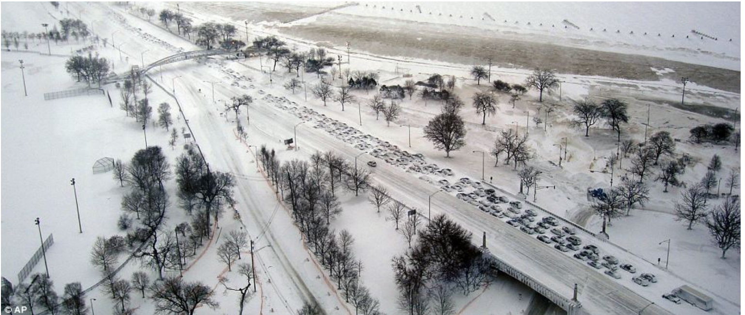
Hundreds of drivers on Lake Shore Drive in Chicago, which was blasted by 20 inches of snow, abandoned their cars in an almost apocalyptic scene as authorities closed the road

La Nina is a periodic cooling of the surface temperatures of the tropical Pacific Ocean, the opposite of the better-known El Nino warming. Both can have significant impacts on weather around the world by changing the movement of winds and high and low pressure systems.