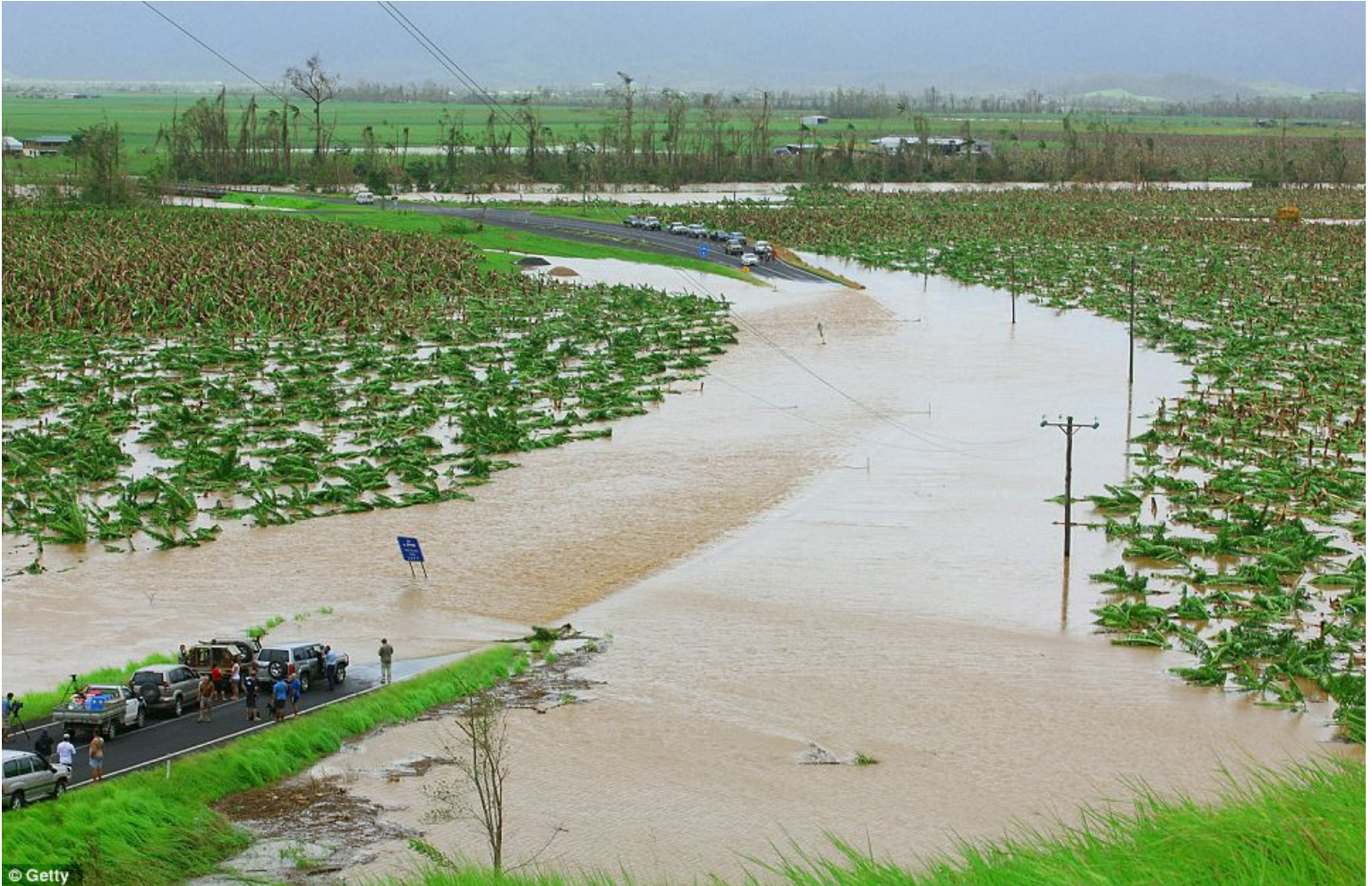
The impact of extreme weather is being felt in north-east Australia where Cyclone Yasi has struck along the coast of Queensland. Here, outside Innisfail, motorists wait for water to subside over the Bruce Highway