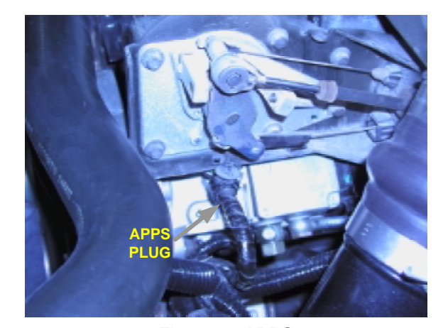
Figure 1: APPS