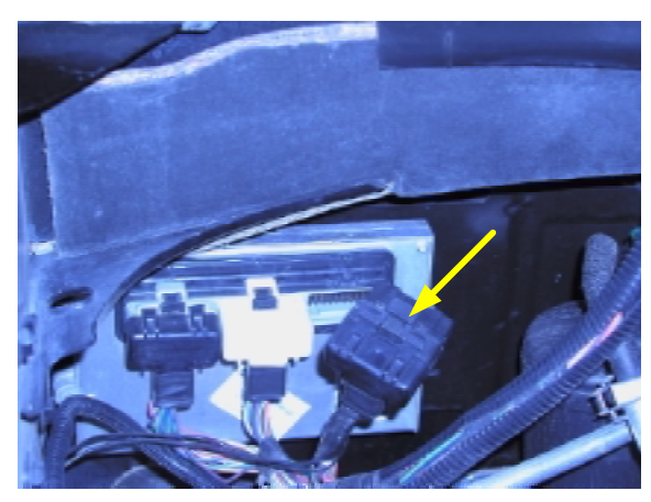
Figure 2: PCM Plug